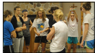
Sr. High Camp—Toothbrush game!

been such a blessing to our parish, and I thank you all for being a part of that. Every year I am amazed and inspired by you, the teenagers of our parish, in how committed you are to