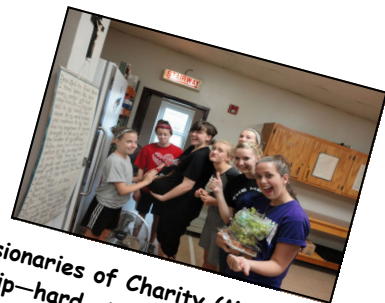
Missionaries of Charity (MOC) Mission Trip—hard at work in the kitchen!

Sr. High Camp: (Gr 9-12) Aug. 5-9 Jr. High Camp: (Gr 6-8) Aug. 13-18 (Monday thru Friday)